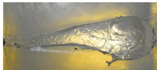
Simulated wound cavity in ballistic soap - .300 Win. Mag. SPEED TIP PRO at 350 m